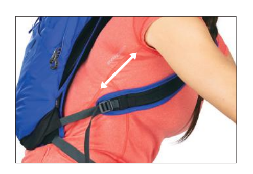
HARNESS The padded part of the harness straps should end 1"/2.5 cm - 2"/5 cm below the armpits.

The backpanel and harness straps should wrap fully around your shoulders with no gaps between the pack and your back.