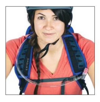
RESERVOIR BITE VALVE MAGNET 20L / 12L / 5L The sternum strap magnet allows for quick access to the reservoir bite valve.

For more information on Osprey's full line of reservoirs and reservoir care, visit osprey.com.