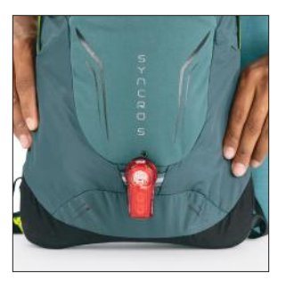
BLINKER LIGHT ATTACHMENT 20L / 12L / 5L Blinker light attachment and reflective patch for safety.