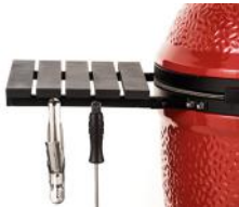
Aluminum Side Shelves