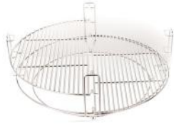
Divide & Conquer® System