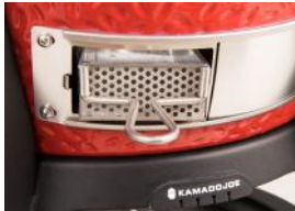
Patented Ash Collector