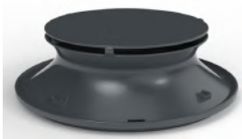
Patented Hyperbolic Insert