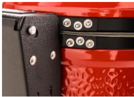
Air Lift Hinge