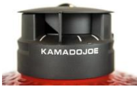
Kontrol Tower Top Vent