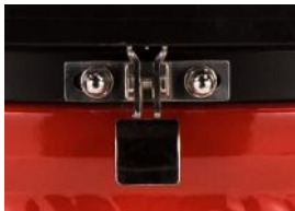
Stainless Steel Latch