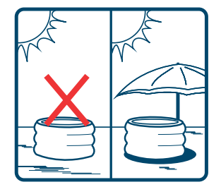
A place with an awning