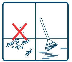
Clean the place